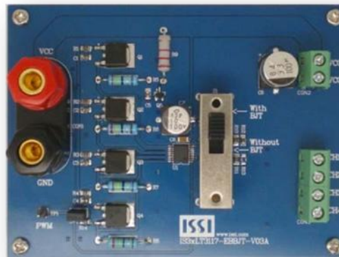
Fig 4 BJT IS31LT3117 Eval Board