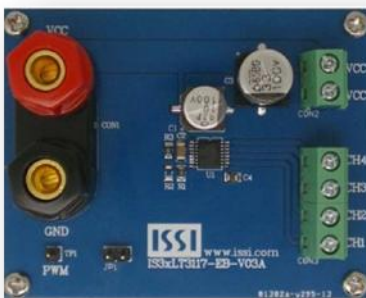
Fig 3 Non-BJT IS31LT3117 Eval Board

Linear drivers are a simple and cost effective solution for driving LEDs; if their heat generation is properly managed. The IS31LT3117 is the right LED driver solution for high brightness LED lighting applications since it provides all the benefits of a linear driver while addressing the thermal issues. ISSI offers two evaluation boards for the IS31LT3117, a non-BJT and a BJT version. The “non-BJT” (Fig 3) is recommended for high current applications where the total LED string forward voltage ( V_f ) is within 1 volt of the supply voltage; V_{SUPPLY} - V_f(\text{total}) < 1V . The “BJT” version (Fig 4) is recommended for high current applications where V_{SUPPLY} - V_f(\text{total}) > 1V .